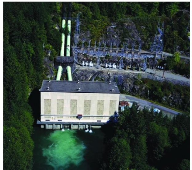
The Fish & Wildlife Compensation Program is conserving and enhancing fish and wildlife impacted by BC Hydro dam construction in this watershed. Top row from left: Cheakamus Dam and powerhouse. Bottom row from left: Squamish River Powerhouse (Credit BC Hydro). Cover photos: Coho fry (Credit iStock) and Roosevelt Elk (Credit iStock).