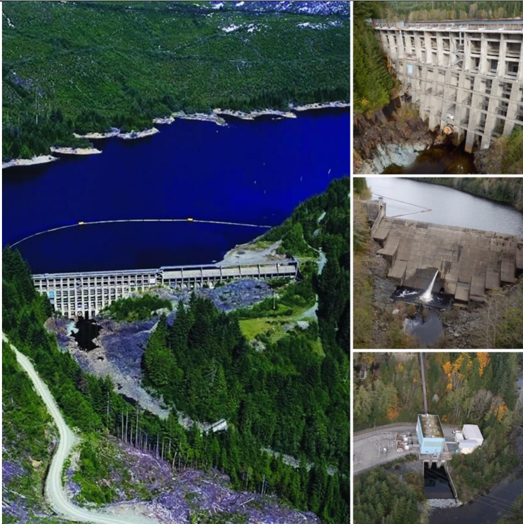
The Fish & Wildlife Compensation Program is conserving and enhancing fish and wildlife impacted by BC Hydro dam construction in this watershed. Clockwise from left and top right: Jordan River Diversion Dam, Elliot Dam, and Jordan River Generating Station. Cover photo: Pink Salmon