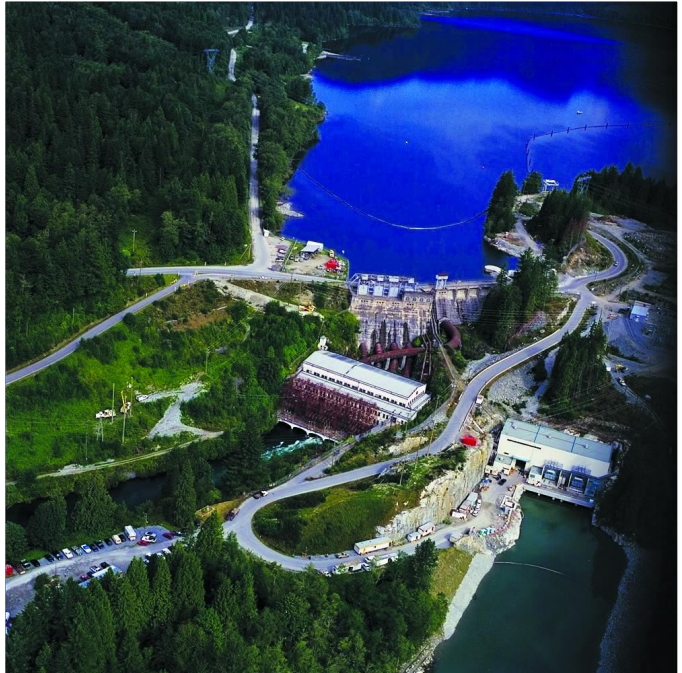
The Fish & Wildlife Compensation Program is conserving and enhancing fish and wildlife impacted by construction of BC Hydro dams in this watershed. From left: Ruskin Dam, Stave Falls Dam. Cover photos: Coho fry, Great Blue Heron.