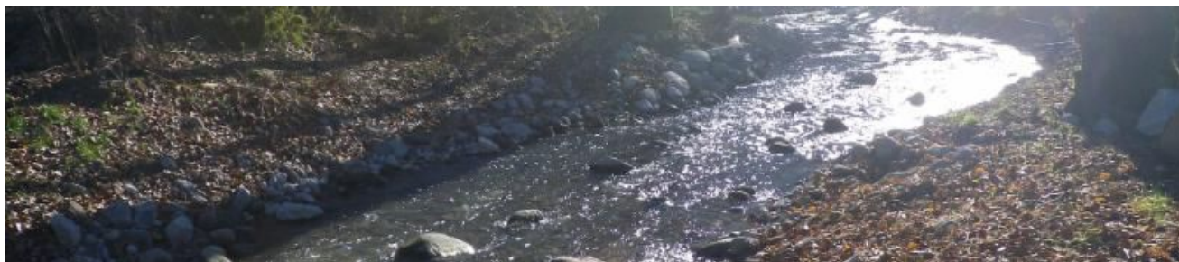
Spawning habitat created, with FWCP support, near Cheakamus River in 2014