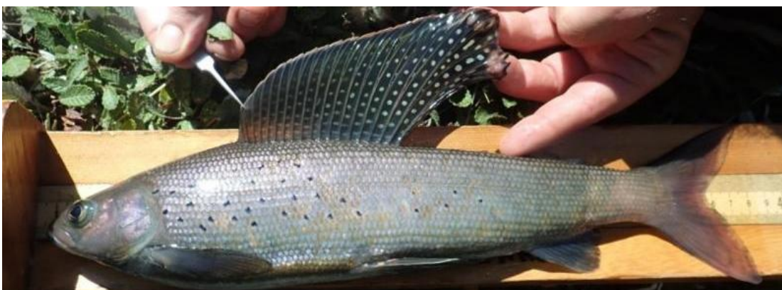
Arctic Grayling is one of many species being supported by FWCP funding in 2020-2021.

We will be announcing our Peace Region's 2020-2021 projects in the next few weeks. Across our three regions approximately $8.7 million was approved for 99 fish and wildlife projects.