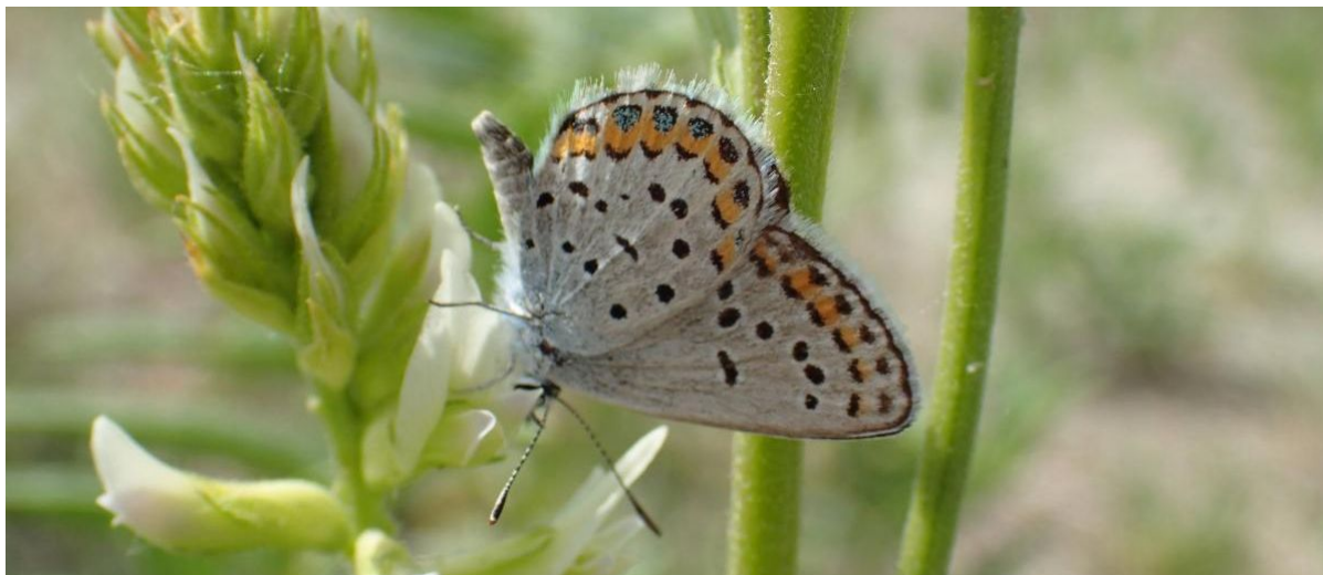
Wild licorice (pictured) is one of 42 native species planted to attract pollinators like this Melissa blue butterfly.